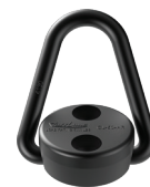
Pivoting Hoist Ring